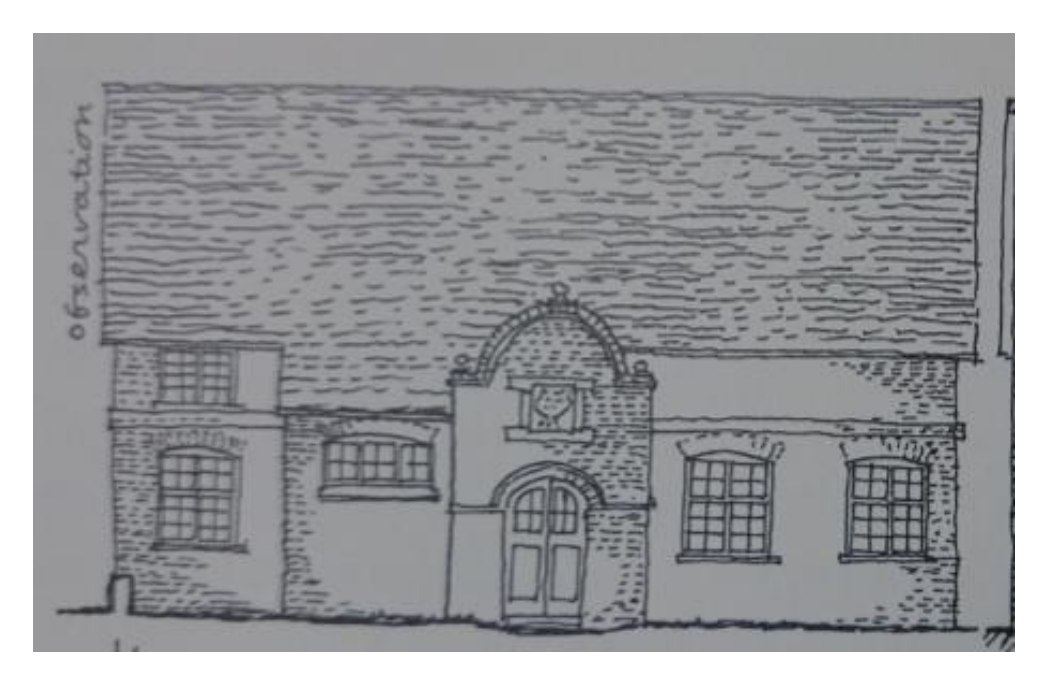
Figure 1: Meeting House on Frodsham Street in 1703. Drawing by Butler (1999, vol.1. p. 46)